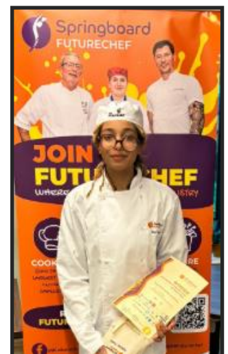
FutureChef National finalist

Beyond the laboratory and clinic, the course mainly prepares students for leadership roles within the hospitality and business sectors including Hospitality Management, the technical skills mastered here are vital for becoming a Chef, Head Chef or Development Chef . Ultimately, this GCSE demonstrates to employers and universities that you possess a blend of technical precision, scientific understanding, and high-level cooking skills.